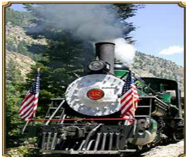
Georgetown, CO RR