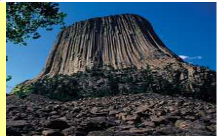
Devils Tower Natl Monument